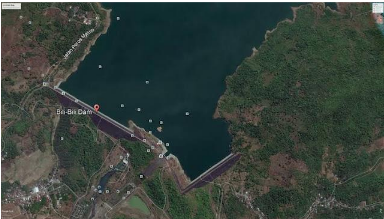
Fig 1: Research location (Bili-Bili Dam)

This research was conducted at Bili-bili Dam is located in Bili-bili Village, Parangloe District, Gowa Regency, South Sulawesi Province, which is located 30 km east of Makassar City.