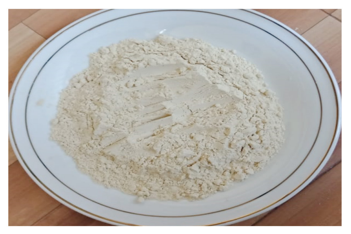
Fig. 1: Foxtail Millet Flour

Despite the fact that foxtail millet and flying fish are abundant in West Sulawesi province, people remain<sup>27</sup>nder-utilized as a food source. It is only traditionally managed and did not extend to the entire community. Especially for flying fish which has a short nelf life and the quality of this food may be decreased depending on water content.<sup>13</sup> In addition, the production of flying fish does not exist at any time due to the influence of seasonal changes. As a results, people in the communities are rarely consumed this food. Therefore, a powdering process for this food may be a good way to maintain