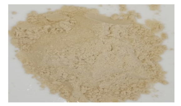
Fig. 2: Flying Fish Flour

The chemicals used for proximate analysis were aquadest ( H_2O ), sodium hydroxide, selenium, cuprum sulfate ( CuSO_4 ), red methyl indicator, sodium sulfate, indicator, hydrochloric acid 001 N, hydrochloric acid 3%, acid nitrate concentrated, sodium tetra borate, selenium catalyst, iodide kalium solution (KI 20%), sulfuric acid solution, boric acid solution 2%, SeO_2 , 25% K_2SO_4 , NaOH 30%, H_2SO_4 25%, H_2SO_4 1.25%, sodium thiosulfate solution