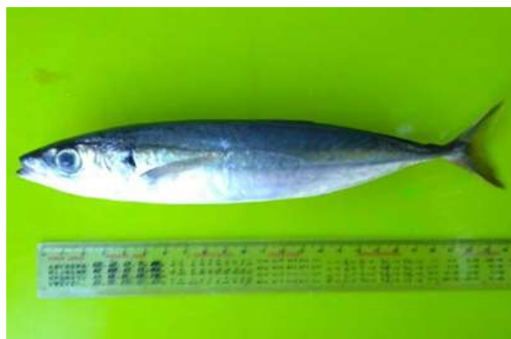
Figure 3. Shortfin scads fish