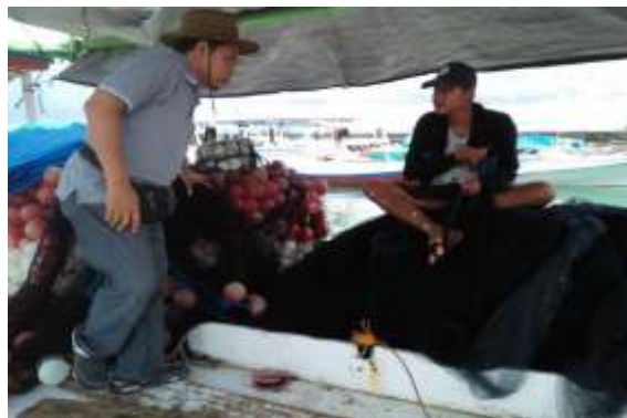
Figure 2. Purse seine fishing gear

Purse seine dimension used namely length 300-500 m, depth 30-50 m and made of polyamide twine number 6 for wing and body parts while number 9 for bag part with 1-inch mesh size (figure 2). Shortfins scads (figure 3) fishing in the Flores Sea can take place for 10 months a year with the peak season were in August-October, the usual were in November; March April; and January-February were off season. However, in reality on the ground, the seasons change and were greatly influenced by wind movements at sea. The wind was very instrumental in determining the success of fishing operations with purse seine.