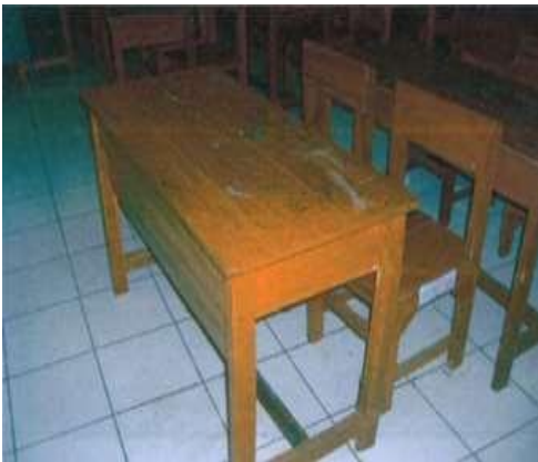
Figure 5. actual desk

Based on the measurements that was carried out on the dimensions of the study desks and chairs at An-Nuriyah Islamic Boarding School Bontocini Jeneponto, there were several mismatches in the anthropometric dimensions of students. Therefore, it requires several improvements. Most of the children's activities at school are carried out in a sitting position. If in average children sit for 6 hours a day, it means that they have to spend 150 hours a month to sit. If there are 260 effective days a year, then children spend their time for over 39,000 hours a year and over 234,000 hours in 6 years to sit. If during their study in the elementary school children perform an inappropriate sitting position since the size of the seats does not pay attention to children's anthropometric, it can result in stunting and backache because the pressure on the spine increases when sitting compared to the standing or lying down position.