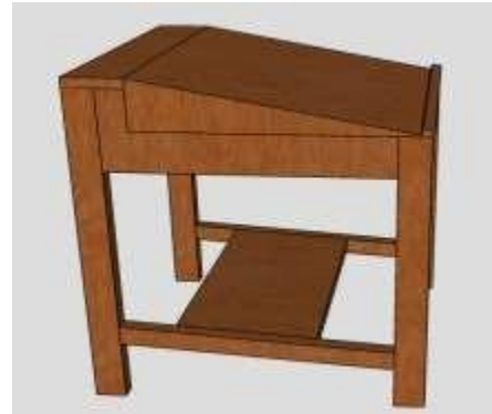
Figure 3. proposed table design

Analysis of the actual desks and chairs prior to designing phase included dimensions of sizes and biomechanical analysis, which were: