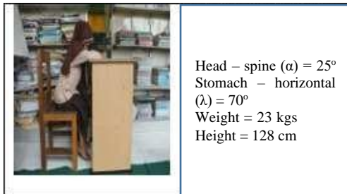
Figure 1 student's sitting position

The calculations of data using the biomechanical approach carried out in this study are as follows: