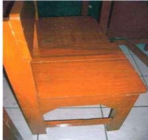
Figure 6. actual chair

Meanwhile, the chairs used to complement the study desk were those generally utilized in other schools the sizes of which were 45 cm wide backrest, 41 cm high backrest, 41 cm long seat, 45 cm high seat, and 45 cm wide seat. The picture of the actual chair can be viewed at figure 6 below: