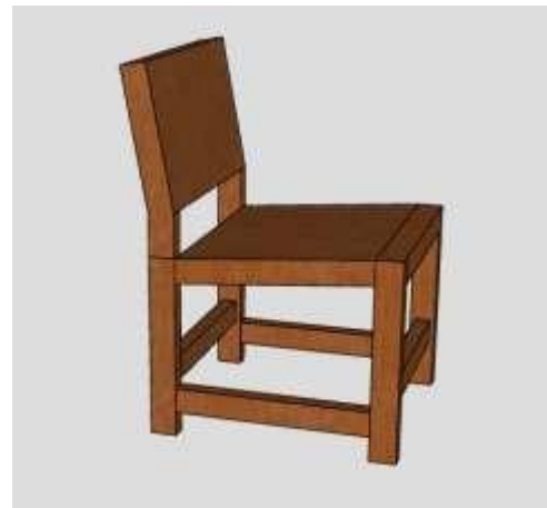
Figure 2. proposed chair design