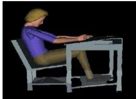
Figure 8. student's sitting position when using the proposed desk and chair

As what occurs in the lumbar , the weight of the head and torso are directly supported by the spine so that they do not have a moment arm to the lumbar . The results of the calculation showed that the amount of the lumbar extensor muscle force ( F_L ) which functions as an enforcer or straightener in the lumbar area was equal to 0. This means that the cervical extensor muscle is not working, or it can be considered that the lumbar extensor muscle is experiencing relaxation. The reaction force that occurred in the lumbar to compensate for the forces that occurs was 241.25 N. Meanwhile, the compression pressure which is the load that occurs in the lumbar was 5.13 \times 10^3 \text{ N/m}^2 . The compression pressure on the neck when sitting upright was reduced by 29.1% and in the lumbar, it was reduced by 36.6%.