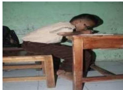
Figure 4. student's sitting position

When using the actual desks and chairs, students tended to feel less comfortable so that they quickly felt fatigue. It was characterized by a mismatch between the dimensions of study desks and chairs and the anthropometry body of students. The instance was when doing writing activity, students tended to be leaning forward and lifting their shoulders as a result of the too high desk top. In addition, the size of the seat was too big so that students were not able to lean on the backrest which may result in backache until spinal abnormalities which could disturb the growth of a child. Moreover, students' feet usually did not touch the floor as well which could cause tingling in their feet.