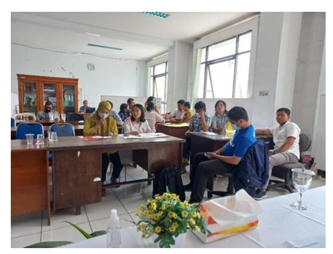
Figure 3. Documentation of the existing problems analysis.

Identification activities were carried out at the service location for one week in early October 2022. The team identified the existing conditions and problems in Lembang Marinding. This activity aims to sort in detail the problems that exist in Lembang Marinding so that the team can figure out the appropriate solution according to existing conditions.