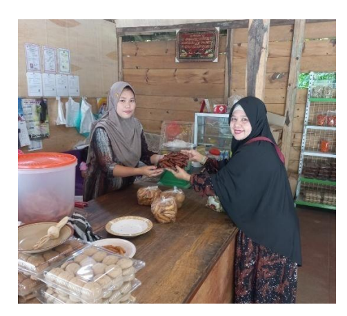
Figure 2. Data collection survey and interview activities.

Data collection surveys and interviews were conducted on October 10, 2022. The survey was conducted by listening to what problems and constraints related to the sale of MSME products, marketing methods, and the costs required in marketing the MSME products in Lembang Marinding. Respondents in the survey and interview activities were the Head of Lembang Marinding Village and several MSME actors. According to Hariono et al. (2021), data collection surveys aim to obtain an overview of the potential and existing conditions. The results are obtained by directly observing the village's condition.