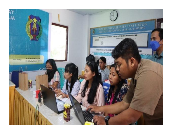
Figure 5. The process of opening the marketplace of bodo shirts and Shopee.

A number of benefits are obtained by MSMEs from this community service, namely MSME actors can understand and recognize the types of marketplaces that foster MSMEs, then MSME actors can register to become fostered participants from the two marketplaces that have been fostering MSMEs, namely the website owned by the South Sulawesi Regional Government (https://bajubodo.sulselprov.go.id) and the Shopee website.