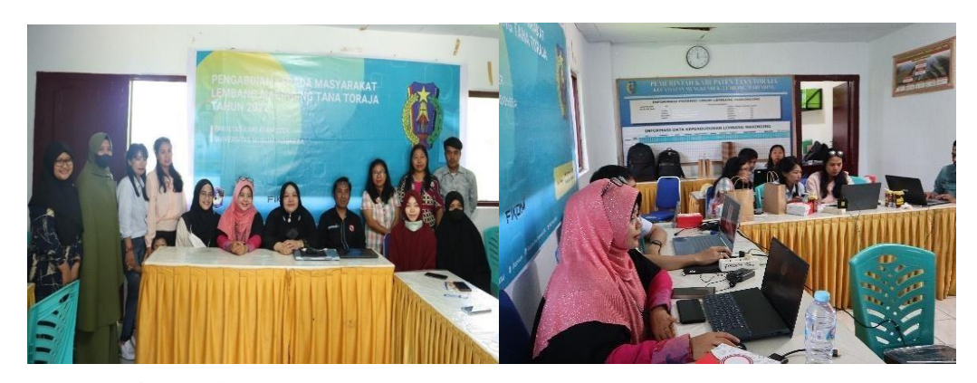
Figure 4. Socialization of marketplace introduction in Lembang Marinding.

The socialization stage was carried out by conveying the benefits of joining the marketplace to the MSME actors. A total of 10 participants attended the extension and socialization of marketplace introduction to increase MSME sales in Lembang Marinding, Mangkedek Subdistrict. The socialization participants were the MSME actors in Lembang Marinding. Lembang Marinding Village has a lot of potential from the agricultural sector, such as bananas, taro, coffee, cocoa, and cloves. In addition, more specifically, Toraja Regency is known as a cultural tourism area for domestic and foreign residents.