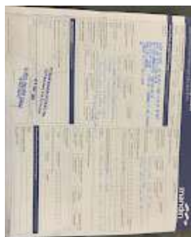
WhatsApp Image 2023-11-06 at 09.33.09.jpeg 257K

Sami Publishing Company (SPC) <samipubco@gmail.com>