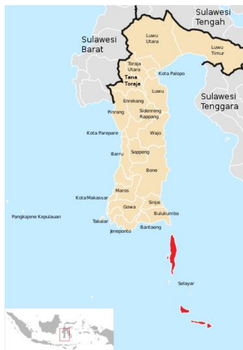
Figure 1. Selayar Islands Regency

The population in this study was the pregnant women in Buki District, Selayar Islands Regency, in 2020 and 2021, about 284. The sample in the study was pregnant women who were estimated using the Proportion Estimation formula: n = (NZ^2 P(1-P))/(d^2(N-1) + Z^2 P(1-P)) ; the sample size was 95 people. The inclusion criteria were as follows: 1) Pregnant women in their second or third trimester of pregnancy; 2) Residing in Selayar Islands Regency, Indonesia; 3) Willing to participate in the study. The exclusion criteria were as follows: 1) Women with chronic diseases, such as diabetes, hypertension, and kidney disease; 2) Women with multiple pregnancies. Data collection was carried out by direct interviews assisted by health workers and health cadres at the research location by implementing health protocols such as maintaining social distance, wearing masks, and disinfecting surfaces.